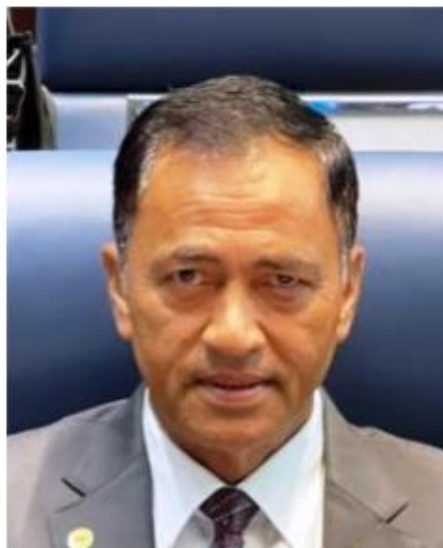
Datuk Yakub Khan

KOTA KINABALU (Nov 29): The 2023 State Budget and development allocation amounting to RM1.5 million under 12th Malaysia Plan (12MP) in 2021 for science infrastructure development will be fully utilised.